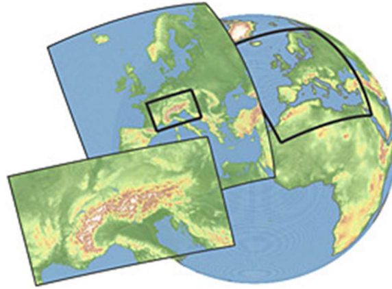
Figure 2: Illustration of WRF Limited Area Model (LAM) domain versus global domain

The NCAR climate model is based on a historical simulation of the period from 2000-2013 that provides hourly snapshots of the state of the atmosphere - including wind, temperature, precipitation and radiation balance - at 4 km (2.5 mi) resolution over all of the continental United States and much of Canada and Mexico. The NCAR domain is shown in Figure 3.