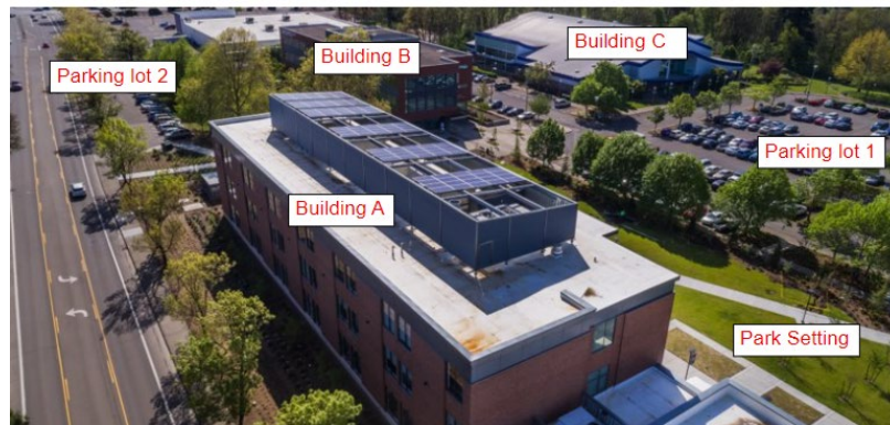
Figure 2: Corporate Campus

Alternatively, if three Commercial spaces are vacant and the property owner wants to upgrade the lights in all of them, then this would be considered one participant. The entire shopping plaza would be considered as a single project with a $250,000 project cap.