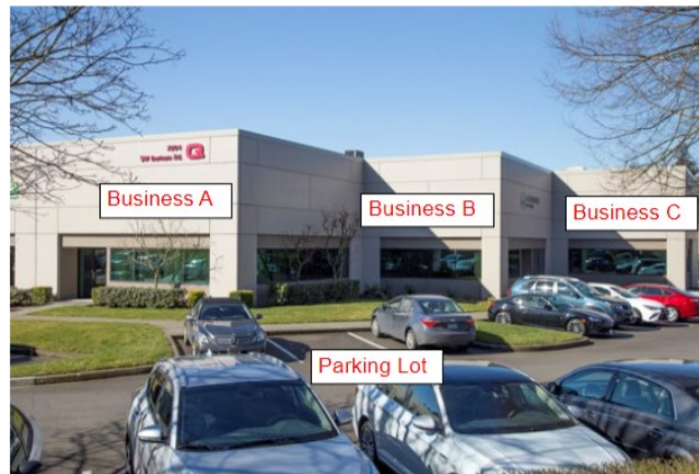
Figure 1: Shopping Plaza

If a participant wants to complete multiple lighting projects at a site or wants to complete a project in multiple phases, the total incentives for all projects and phases may not exceed the annual lighting site cap of $250,000 cap.